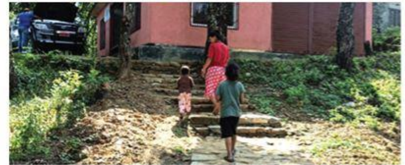
Families access health care center in Nepal on new path

Working with families of the Gorkha District in rural Nepal, Shanti Nepal helps organize and provide quality health care services, education, and supplies for the most disadvantaged in the community. More than 3,700 women, children, and families have received basic health care support.